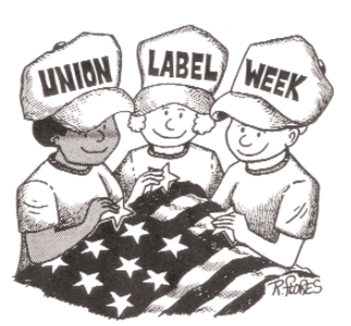
SEPTEMBER 1-6, 2003