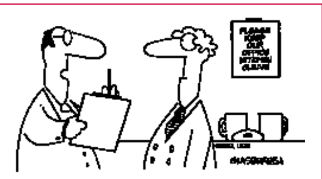
"Research indicates that coffee and donuts are inferior sources of energy. We recommend you stock the breek room with coel."